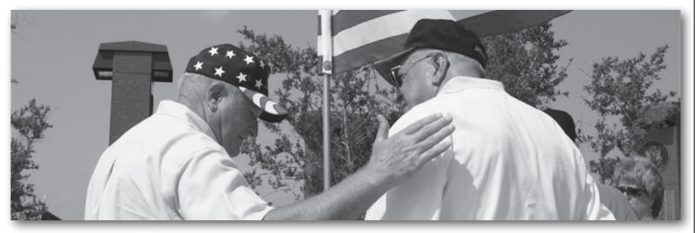
Monday, May 31 • 10 a.m.

Join us for a Virtual Memorial Day Ceremony as we pay tribute to those Grand Prairie service men and women who made the ultimate sacrifice for our freedom. A link to view the live ceremony will be available on GrandFunGP. com prior to the event. For additional information, visit GrandFunGP.com or call 972-237-8100.