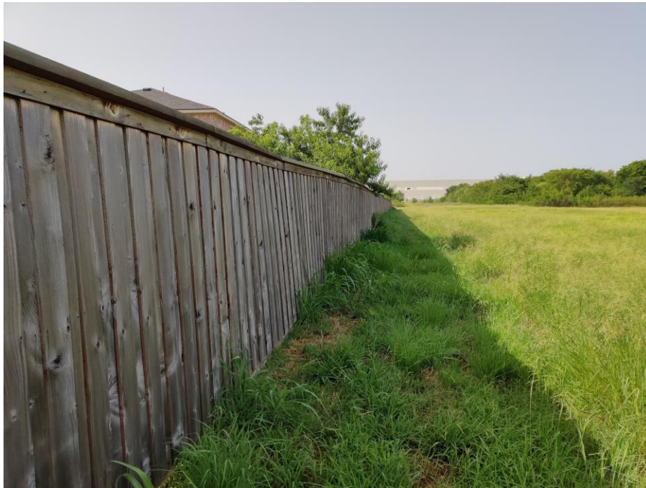
Old Fence Color