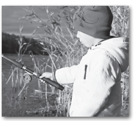
Saturday, Feb. 11, 10 a.m.-2 p.m. Mike Lewis Park 2600 Block of North Carrier Pkwy.

Come reel 'em in at the fullystocked lagoon! FREE for children 16 and younger with on-site registration. A limited number of loaner rods and reels will be available on a first-come. first-served basis with a driver's license or credit card deposit. For more information, call 972-237-8100 or visit GrandFunGP.com.