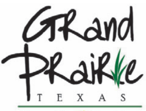
Dream Big 🗡 Play Hard