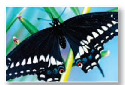
Grand Prairie has natural beauty!

Reading is Fun-damental