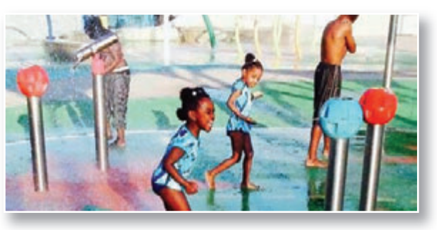
How wet can you get?