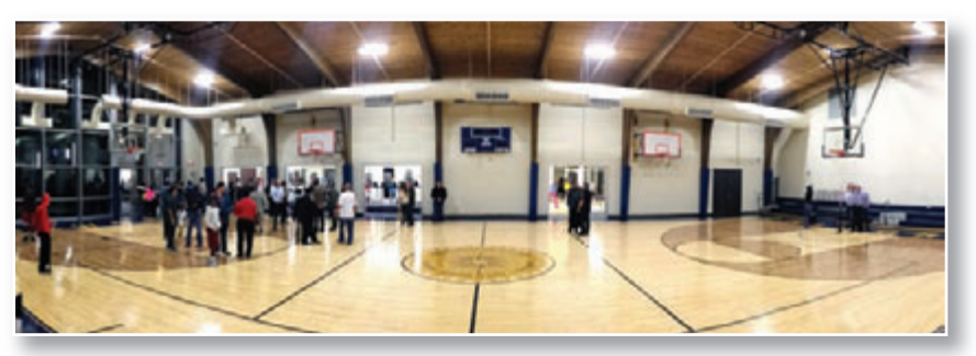
The new Dalworth Recreation Center gym is grandtastic!