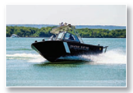
Lake patrol at Lake Joe Pool.