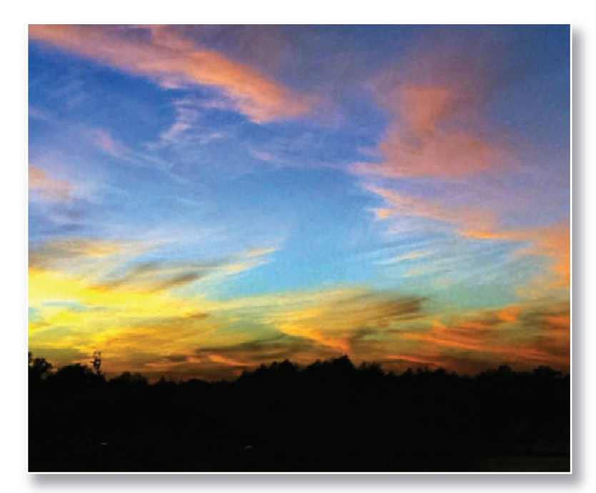
Beautiful nights in Grand Prairie.