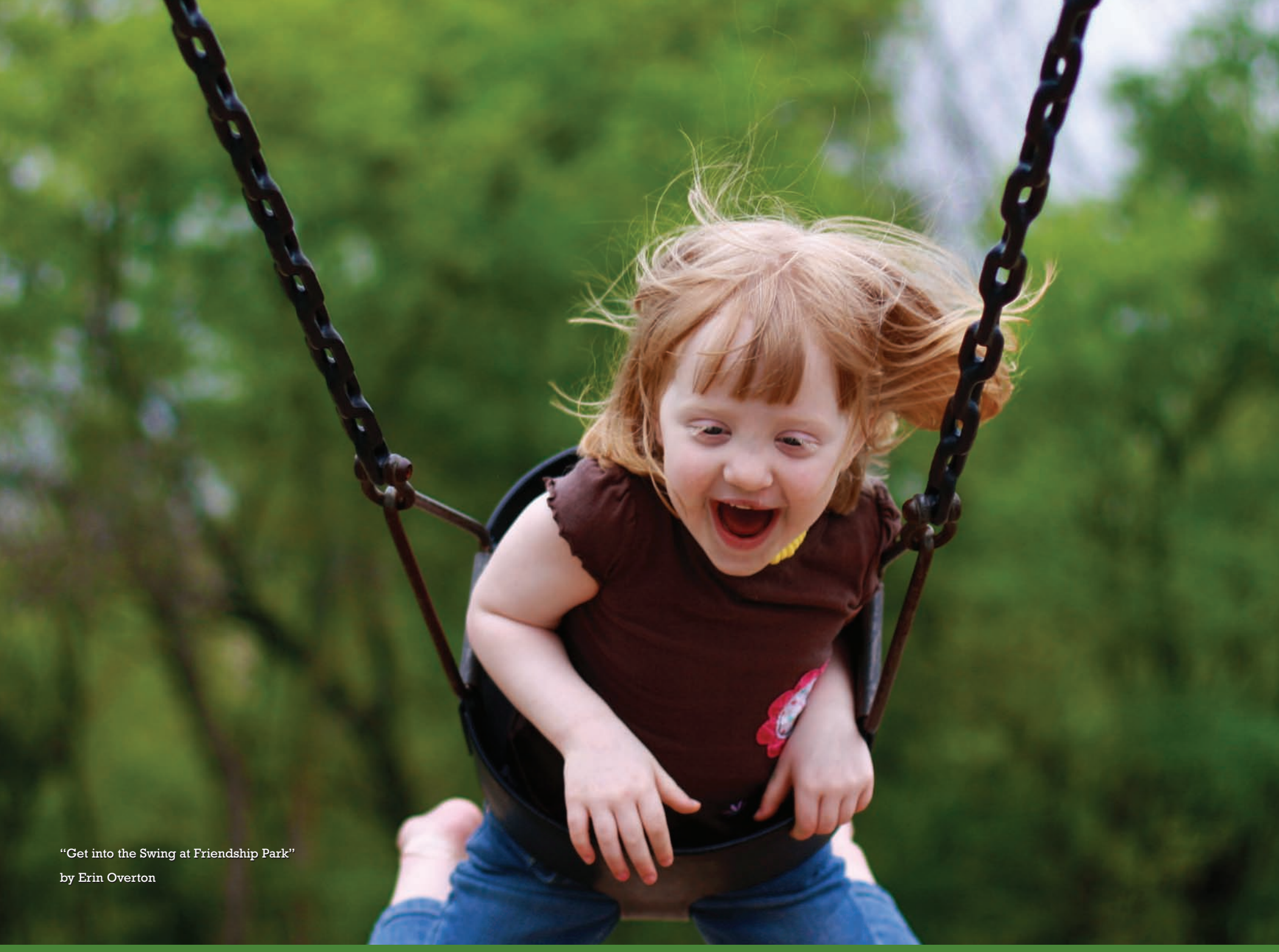
For the latest information on everything in Grand Prairie, log on to gptx.org, find "City of Grand Prairie" on Facebook, or cityofgptx on YouTube.com