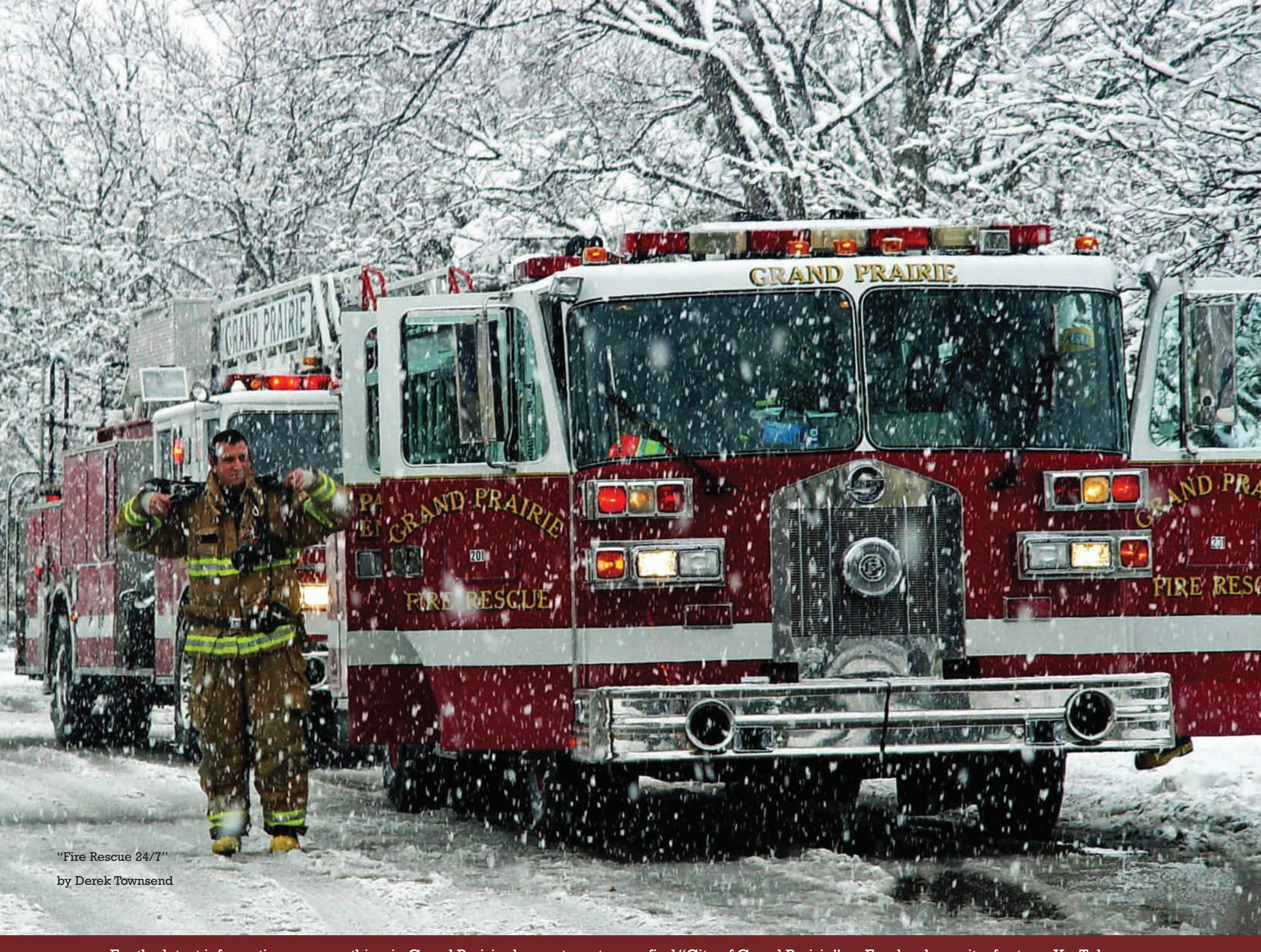
For the latest information on everything in Grand Prairie, log on to gptx.org, find "City of Grand Prairie" on Facebook, or cityofgptx on YouTube.com