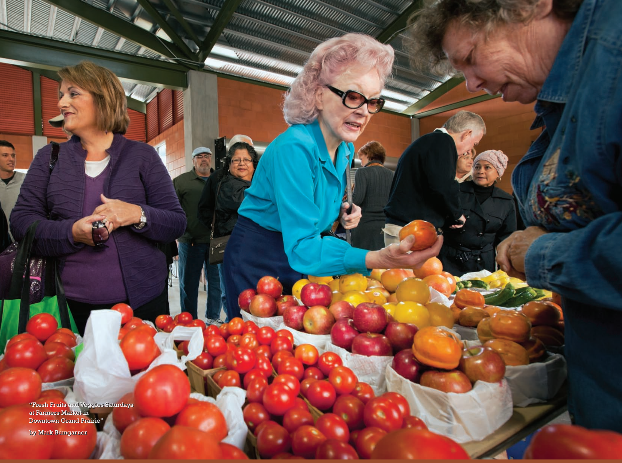
For the latest information on everything in Grand Prairie, log on to gptx.org, find "City of Grand Prairie" on Facebook, or cityofgptx on YouTube.com