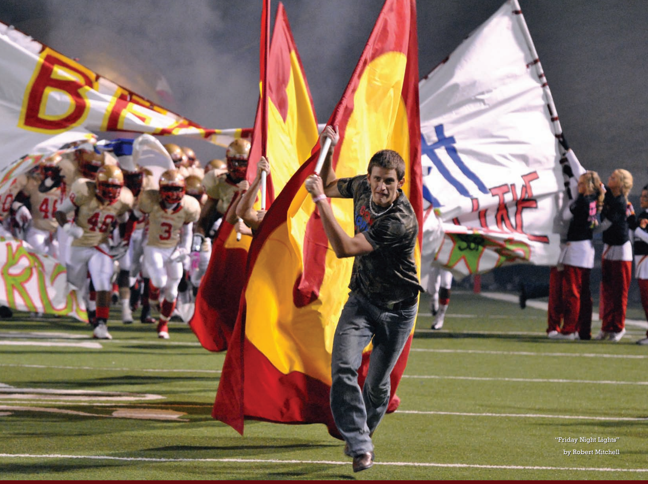
For the latest information on everything in Grand Prairie, log on to gptx.org, find "City of Grand Prairie" on Facebook, or cityofgptx on YouTube.com