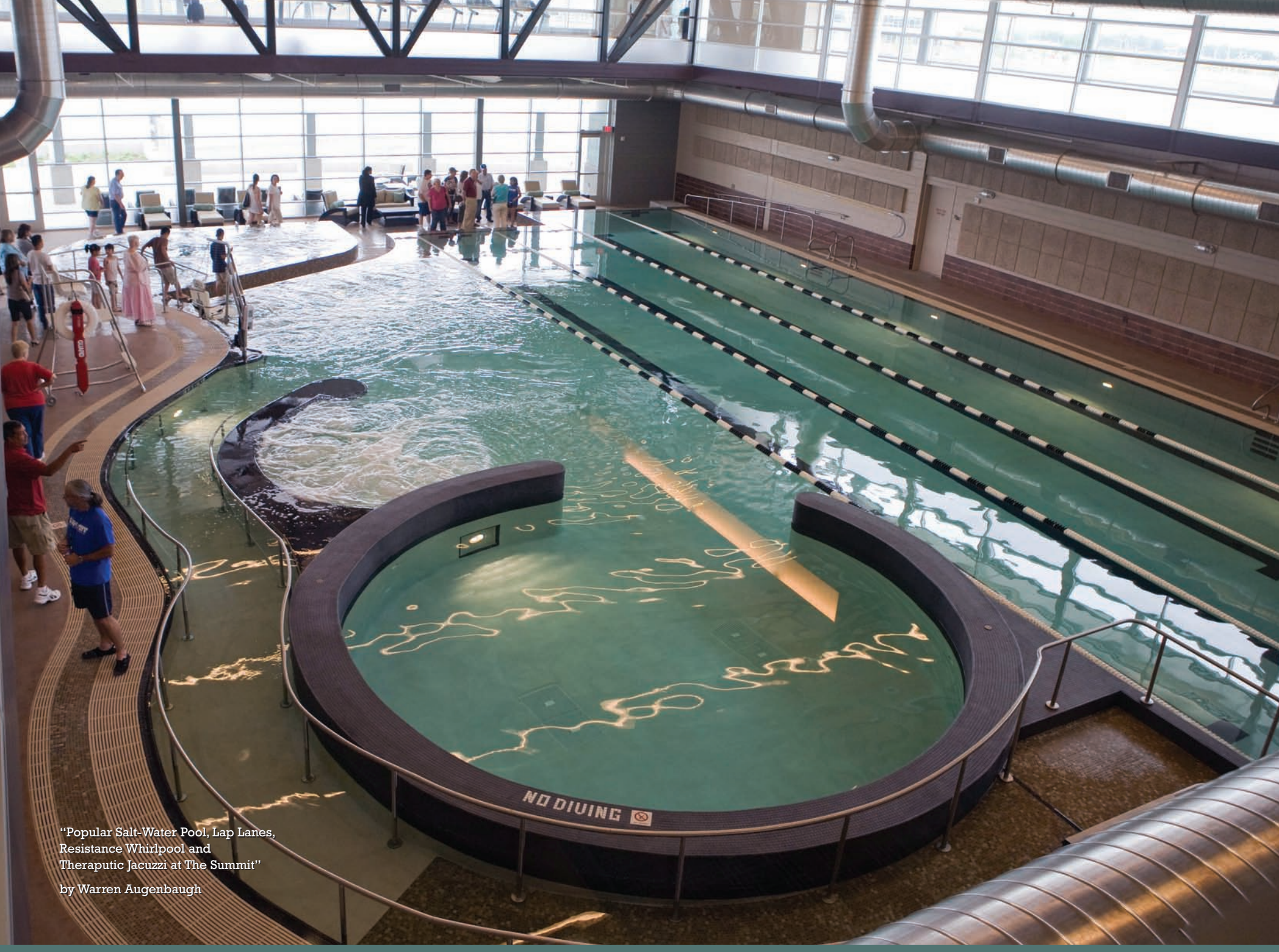
For the latest information on everything in Grand Prairie, log on to gptx.org, find "City of Grand Prairie" on Facebook, or cityofgptx on YouTube.com