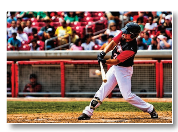
"Batter Up at QuikTrip Ballpark" by Brad Barton

(Per $100 Assessed Property Value) City of Grand Prairie $0.669998 Grand Prairie ISD $1.465000 Arlington ISD $1.335000 Cedar Hill ISD $1.440000 Mansfield ISD $1.496000 Dallas County $0.2431 $0.26400 Tarrant County