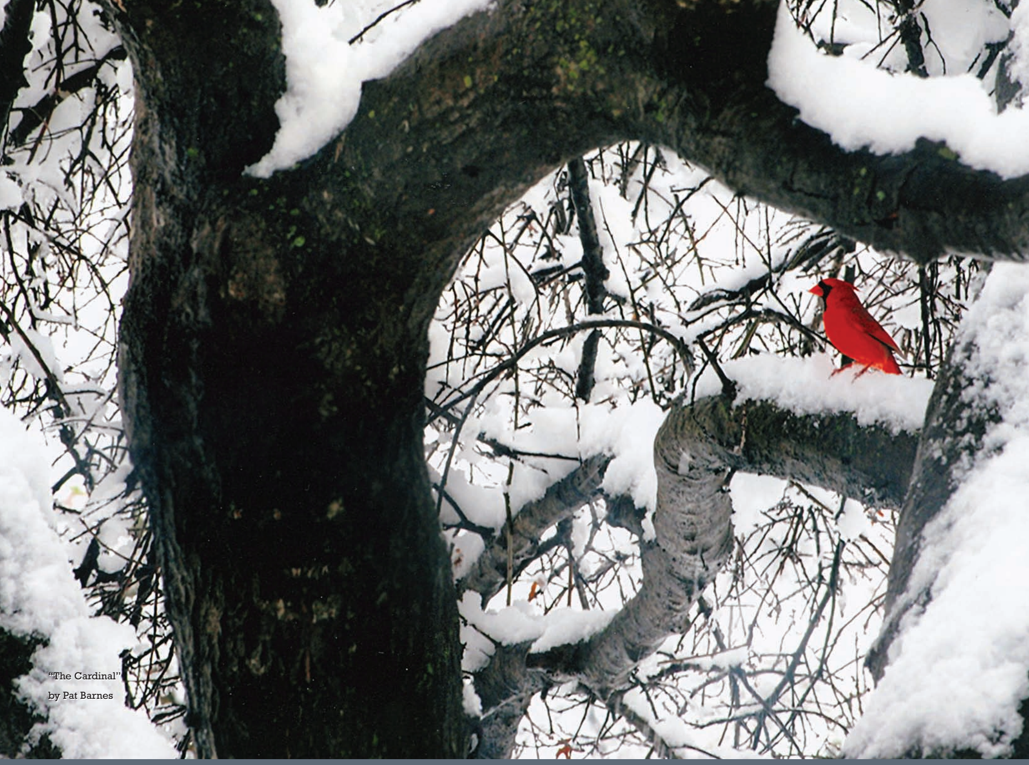
For the latest information on everything in Grand Prairie, log on to gptx.org, find "City of Grand Prairie" on Facebook, or cityofgptx on YouTube.com