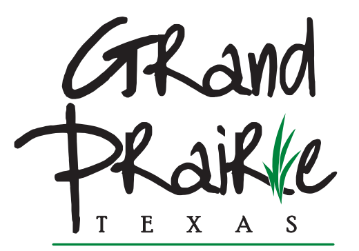
Dream Big / Play Hard