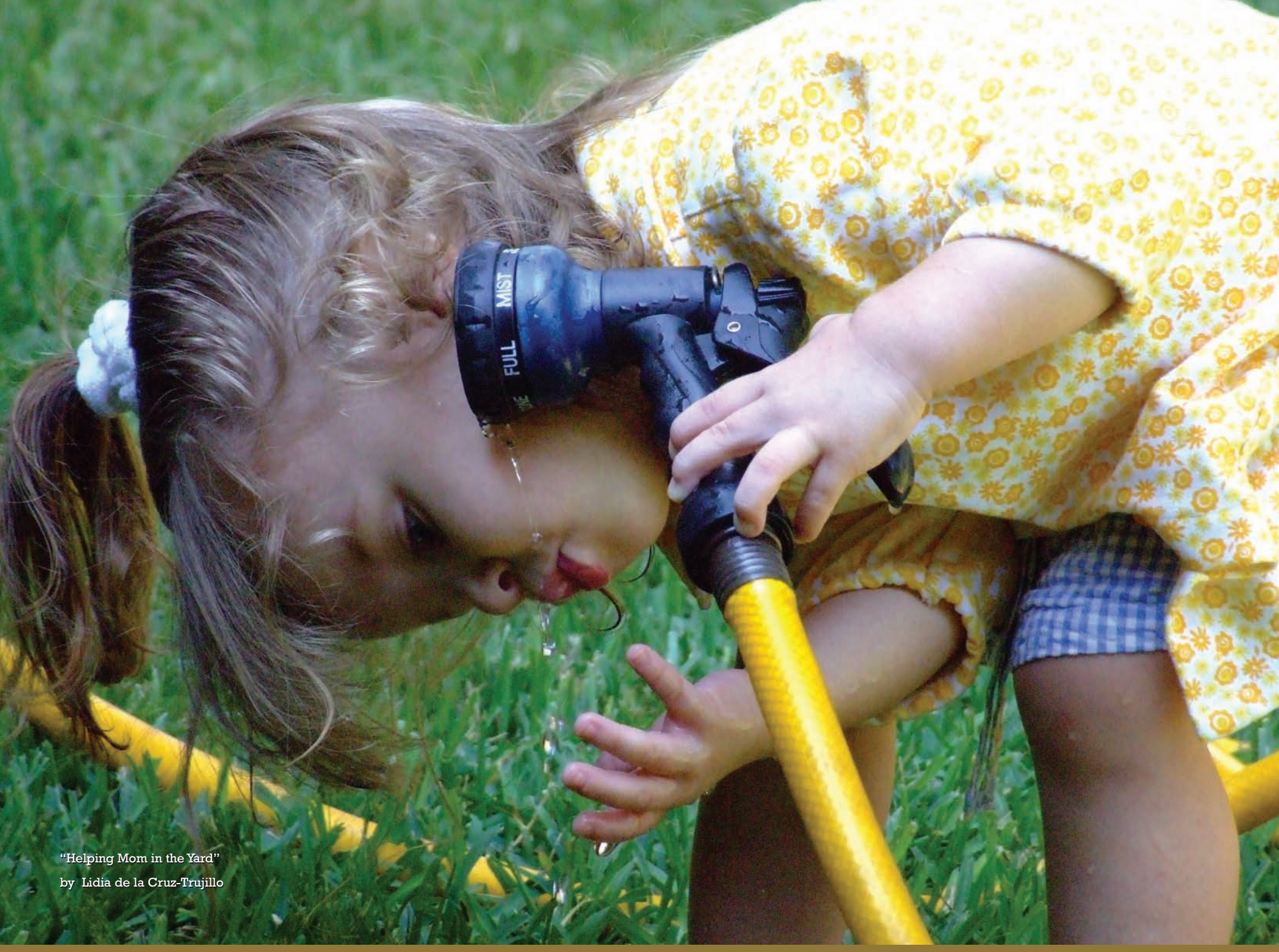
For the latest information on everything in Grand Prairie, log on to gptx.org, find "City of Grand Prairie" on Facebook, or cityofgptx on YouTube.com