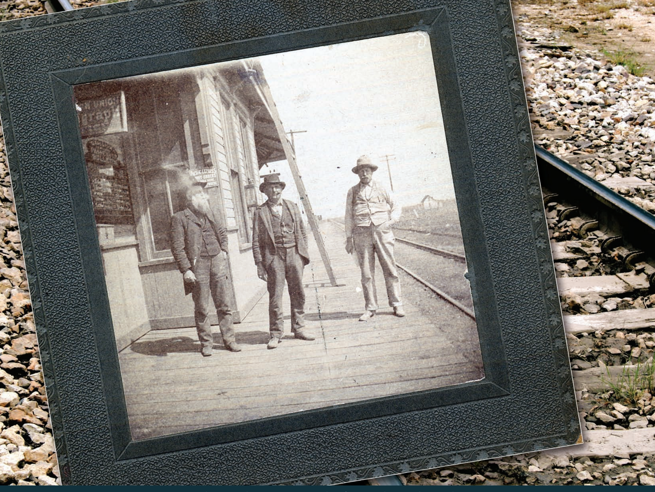
Train depot Grand Prairie, circa 1895.