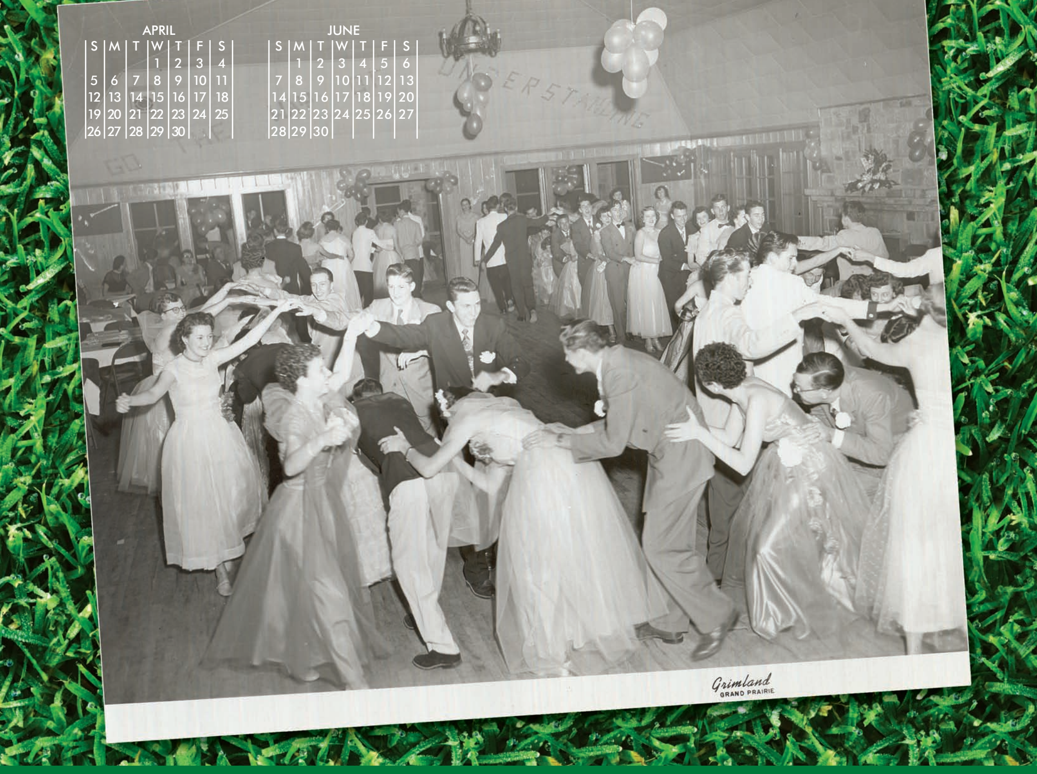
GPHS Prom, 1946.