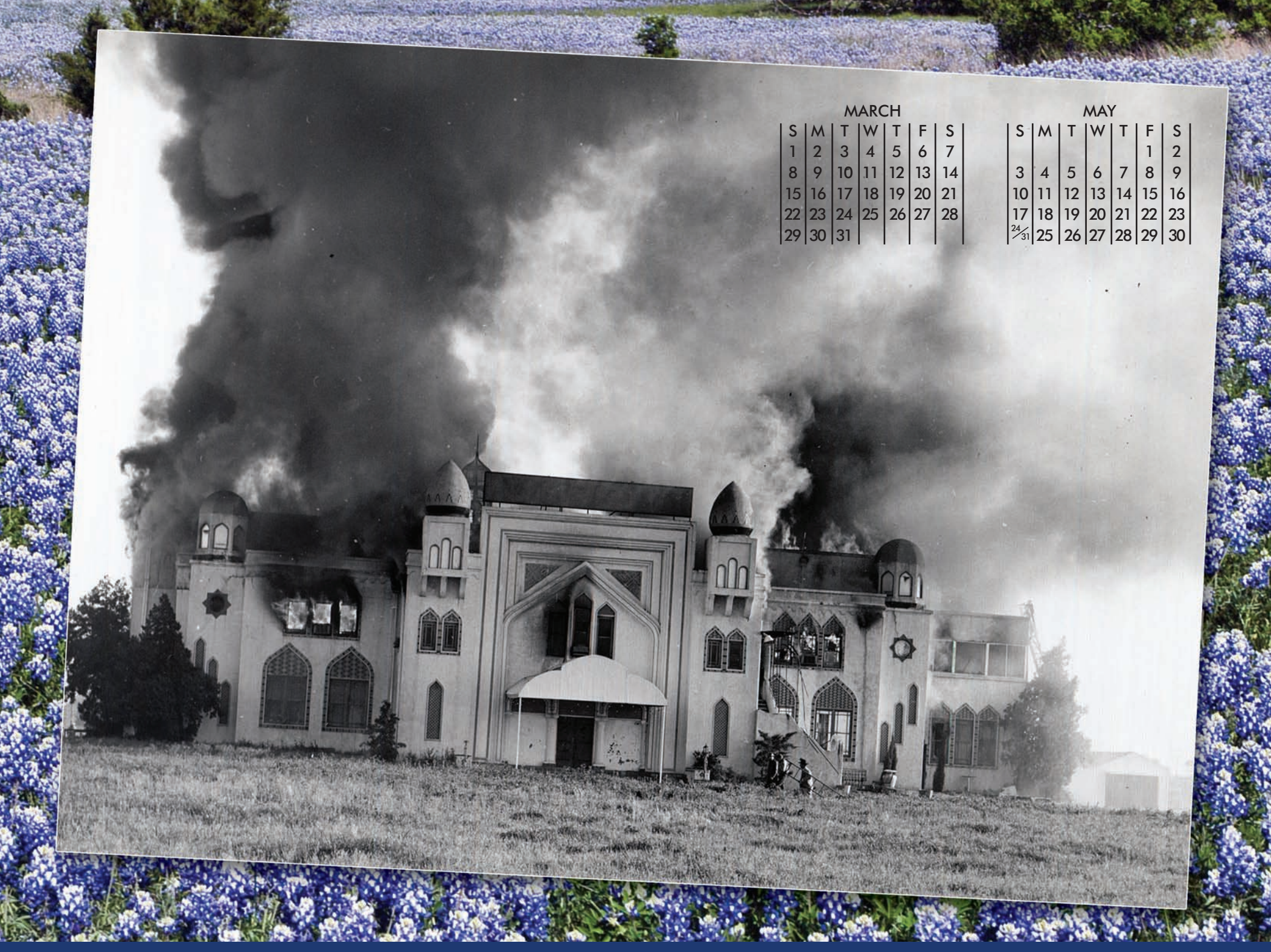
1953 Bagdad Club burns.