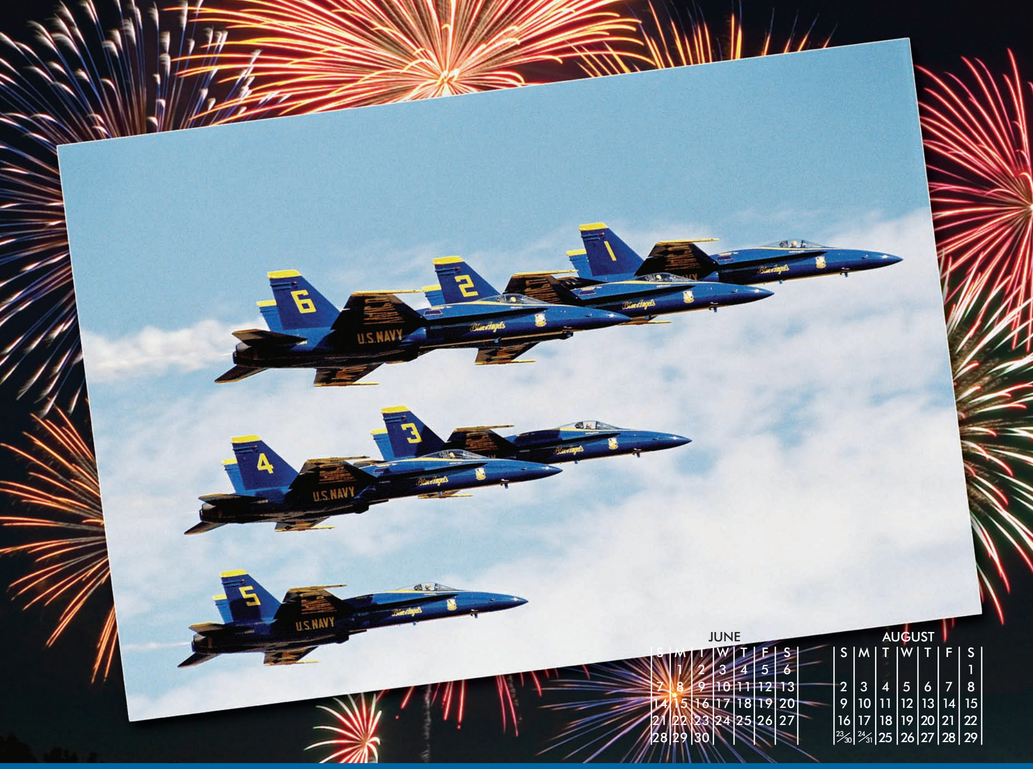
1989 Blue Angels air show.