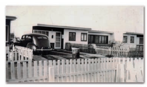
Avion Village, 1941.