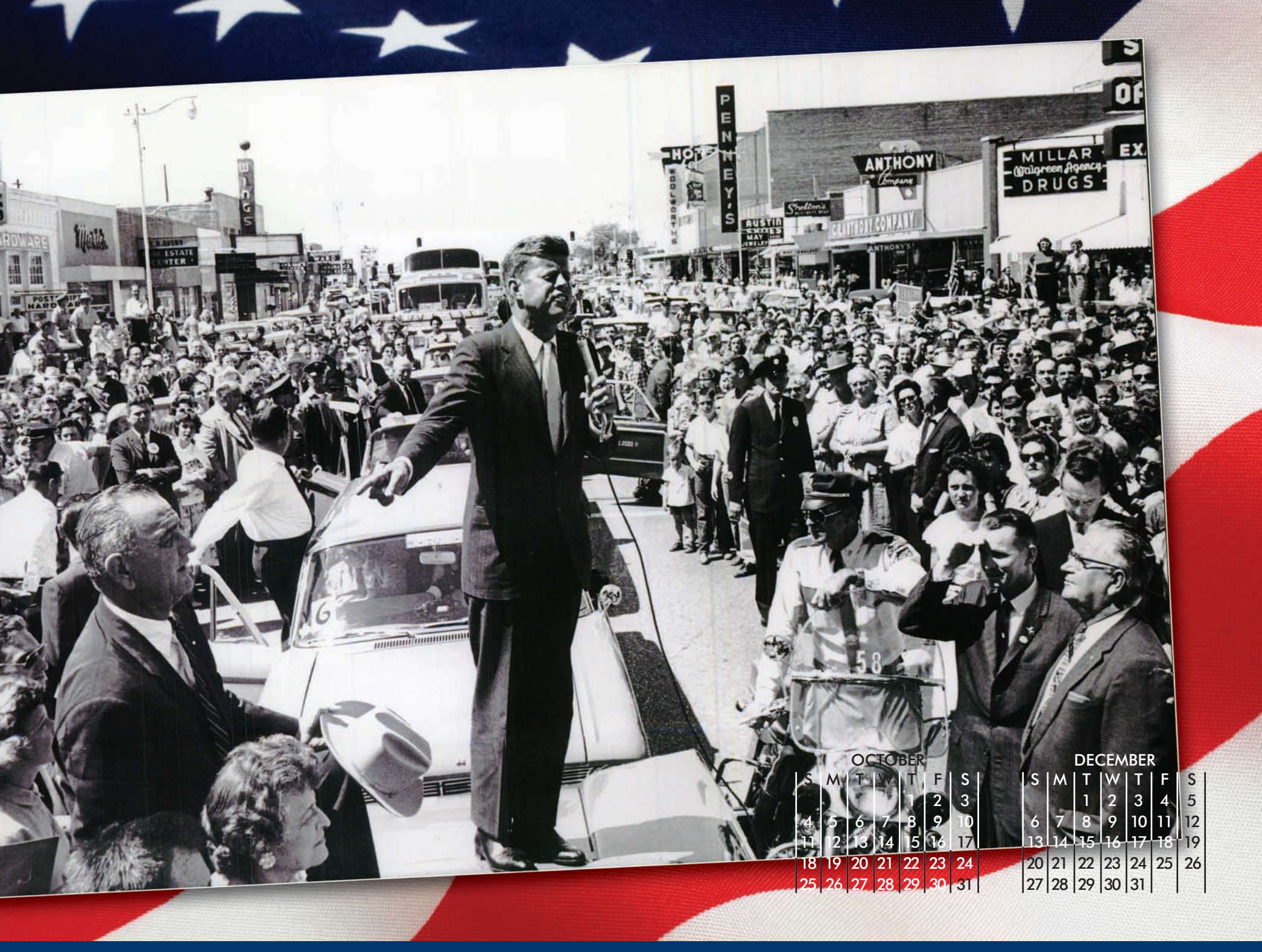
JFK and LBJ, 1961.