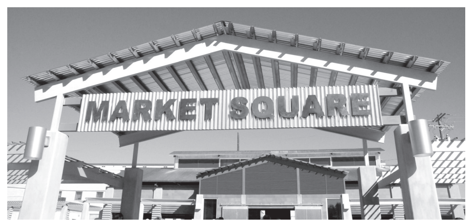
Saturdays, 8 a.m.-1 p.m. Grand Prairie Farmers Market, 120 W. Main St.

The Farmers Market reopens on Saturday, April 6. Explore fresh produce, tasty food and unique crafts. gptx.org/farmersmarket