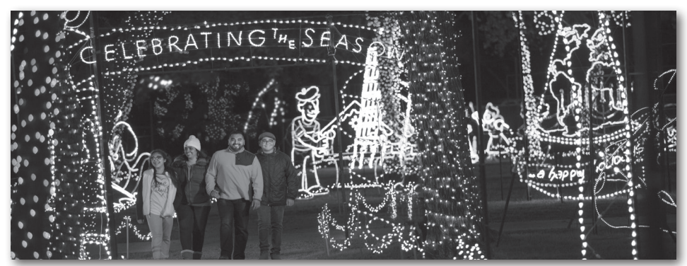
Thursday, Nov. 23-Sunday, Dec. 31 Opens nightly at 6 p.m.

Lynn Creek Park on Joe Pool Lake, 5610 Lake Ridge Pkwy