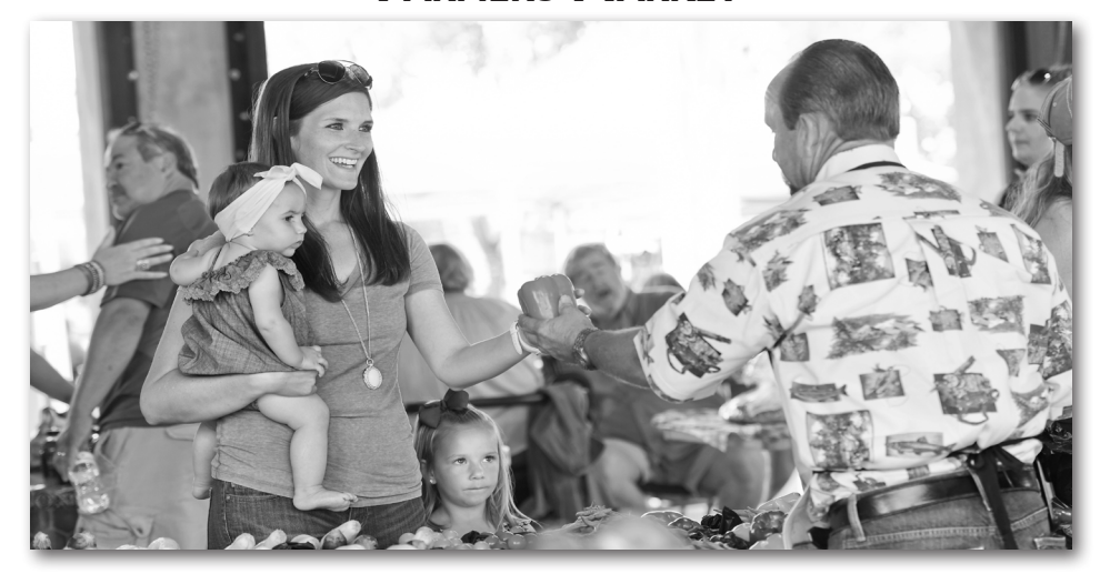
Market Square, 120 W. Main St. • Open Saturdays 8 a.m.-1 p.m.

Farmers Market features locally grown fruits, vegetables and more. For more information call 972-237-4599 or visit GrandFunGP.com/farmersmarket.