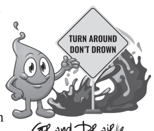
GRAND PRAIRIE STORMWATER DIVISION

The City of Grand Prairie uses several tools to help keep residents informed and safe during flooding rain and storm events. One of these is through the city's Flood Warning System (FWS), which measures water levels at various creeks and channels around town and gives real time updates on levels. These levels are used to alert first responders of high water so that actions can be taken to keep residents safe. The public can view data from these sensors by visiting gptx.onerain.com.