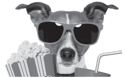
Saturday, Sept. 17, 6-11 p.m. Grand Lawn at EpicCentral 2960 Epic Place

EpicCentral will host the 2nd Annual Paws in the Park followed by Movies on the Lawn. Dogs of all shapes and sizes are invited to take part in the tail waggin' fun. Furry friends will have the opportunity to cool off in a splash zone dog park. Owners will have the opportunity to gather important information on how to care for their dogs and enter a free raffle that will include fun items for their pups. At sunset, a special movie will be shown on the big screen with sweets and treats available for purchase. A photo contest for cutest pup will be held leading up to the event. For info.: GrandFunGP.com.