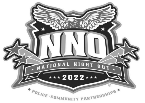
Tuesday, Oct. 4