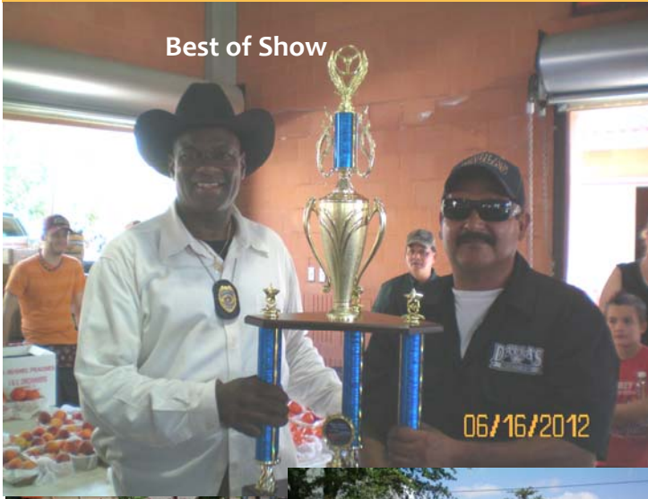
Best of Show

On June 16 th , the Code Enforcement Auto Related Business program presented the 4 th Annual Farmer's Market Car show. The show was called "The Mayan Countdown" in deference to the apocalyptic Mayan prediction for 2012.